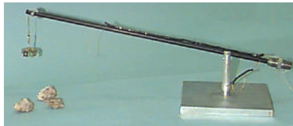
FIGURE 4: A view of the robotic arm that is driven by EAP actuators.

Lesson learned from Viking and Mars Pathfinder missions indicates that the operation on Mars is involved with an environment that causes the accumulation of dust on the hardware surfaces. The dust accumulation is a critical problem that hampers long-term operation of optical instruments and degrades the produced power efficiency of solar cells. To remove dust from surfaces one can use a similar mechanism as the windshield wipers of cars. Unfortunately, conventional surface wiping mechanisms are cumbersome, heavy, power gazzler and cannot be practical for such tasks as cleaning individual solar cells. On the other hand, IEMP bending actuator has the ideal characteristics of surface wiper. As shown in Figure 1, a simple, small, lightweight, low power consuming surface wiper can be constructed using an ionomer film. The ionomer responds to activation signals at the millisecond range and the angle of bending can exceed 180 degrees span and can cover 1.0 - 1.5 inch diameter of a circular area using about 1.5 - 2.0 inch long wiper. The wiper element can be set straight in the middle of the desired area and activated to sweep left and right by switching the electric field polarity. Also, it can be set on the side of the desired area and activated in one direction.