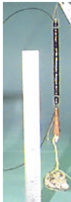
Figure 2: Electrostatic rope with a rock mounted on its bottom.

The availability of EAP actuators that can bend or extend/contract allows producing unique robotic devices that emulate human hands. The authors investigated several potential applications including gripper, robotic arm and surface wiper. As shown earlier, IEMP composite films are demonstrating a remarkable bending strain under a relatively low voltage drive, using a very low power. However, these ionomers are demonstrating a relatively low force actuation capability. Since IEMPs are made of a relatively strong material with a large strain capability, they were employed similar to the function of human fingers. In Figure 3, a gripper is shown using IEMP fingers in the form of an end-effector of miniature low mass robotic arms. The fingers move back and forth to allow opening similar to human hand, embracing the desired object and gripping on it. The hooks at the end of the fingers are function similar to fingernails to secure the gripped object.