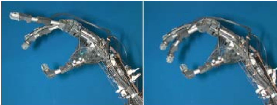
FIGURE 7: Robotic hand (Photographed at JPL) is available at JPL as a platform for demonstration of EAP actuators [Courtesy of Dr. Graham Whiteley, Sheffield Hallam U., UK. The actuators were installed by Giovanni Pioggia – University of Pisa, Italy/JPL].

The ease to produce EAP in various shapes and configurations can be exploited using such methods as stereolithography and ink-jet printing techniques. A polymer can be dissolved in a volatile solvent and ejected drop-by-drop onto various substrates. Such processing methods offer the potential of making robots in full 3D details including EAP actuators allowing rapid prototyping and quick mass production [chapter 14 in Bar-Cohen, 2001a]. Making insect-like robots could help for example to inspection hard to reach areas of aircraft structures where the creatures can be launched to conduct the inspection procedure and download the data upon exiting the structure.