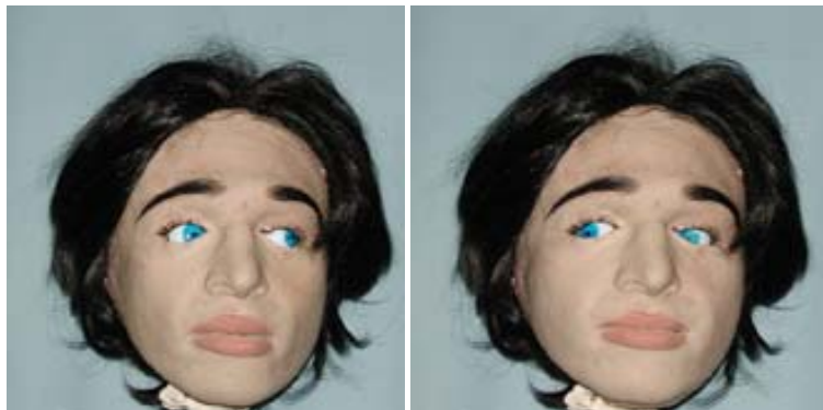
FIGURE 6: An android head (Photographed at JPL) as EAP platform will use such actuators to make facial expressions (Courtesy of G. Pioggia, University of Pisa, Italy).

To promote the development of effective EAP actuators, which could impact the future of robotics, toy industry, animatronics and others, two platforms were developed and are now available at the Jet Propulsion Laboratory (JPL). These platforms include an Android head, which can make facial expressions [see Figure 6 or video showing the Android expressivity on http://ndea.jpl.nasa.gov/nasa-nde/lommas/eap/EAP-web.htm ], and a robotic hand with activatable joints [Figure 7, and video on http://ndea.jpl.nasa.gov/nasa-nde/lommas/eap/EAP-web.htm ]. At present, conventional electric motors are producing the required deformations to make relevant facial expressions of the Android. Once effective EAP materials are chosen, they will be modeled into the control system in terms of surface shape modifications and control instructions for the creation of the desired facial expressions. Further, the robotic hand is equipped with tandems and sensors for the operation of the various joints mimicking human hand. The index finger of this hand is currently being driven by conventional motors in order to serve as a baseline and they would be substituted by EAP when such materials are developed as effective actuators.