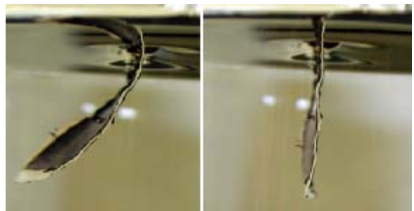
FIGURE 2: Conductive EAP actuator is shown bending under stimulation of 2-V, 50-A.

http://ndea.jpl.nasa.gov/nasa-nde/lommas/eap/EAP-recipe.htm